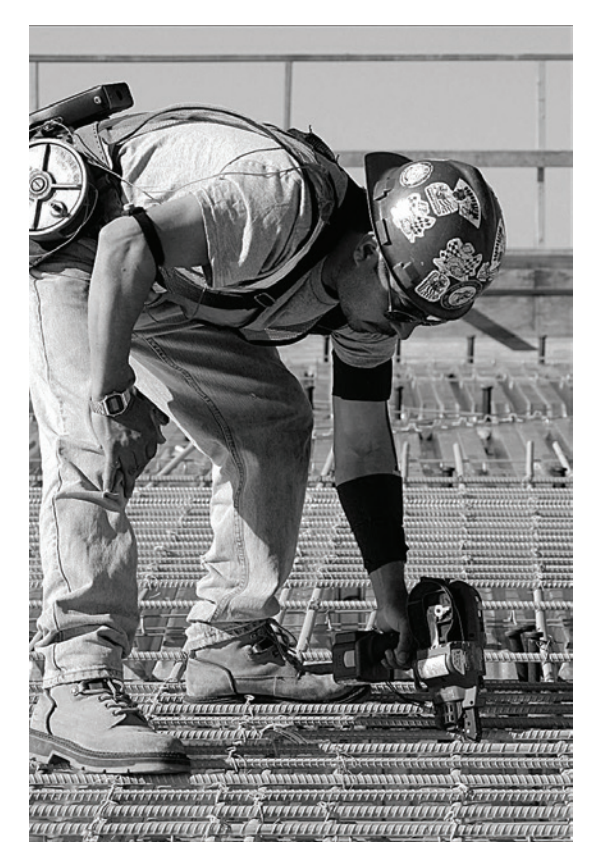
Figure 2. Tying rebar with power tier (PT).

The National Institute for Occupational Safety and Health (NIOSH) introduced a commercially available extension handle developed for use with the PT. This was the third rebar tying technique used during the investigation (Figure 3).