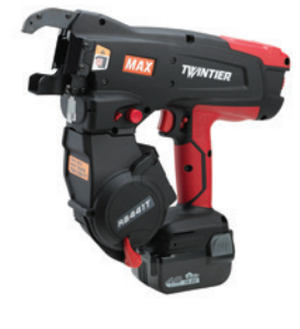
RB441T Ties #3 x #3 Up To #7 x #7 with 19Ga. Wire

RB401T-E Ties #3 x #3 up to #6 x #6 With 19Ga. Wire