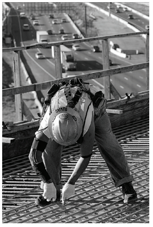
Figure 1. Traditional rebar tying with pliers and spool of wire.

The ironworkers typically employed two techniques to tie the intersecting rebar together: (a) pliers and a spool of wire and (b) a batteryoperated power tier (Model RB392 rebar tier, MAX USA Corp., USA). Pliers were used to wrap and twist the wire around the rebar when more secure ties were necessary while framing the side walls of the bridge deck or making the first ties for each mat. The power tier (PT) was used most frequently to make the remaining ties. Traditional tying (Figure 1) required the use of two hands-one to use the pliers to pull, wrap, twist, and cut the wire and the other to pull and push the wire. Only one hand was necessary to operate the PT (Figure 2). Both techniques required frequent and sustained deep trunk bending (>60° trunk flexion) to tie the rebar.