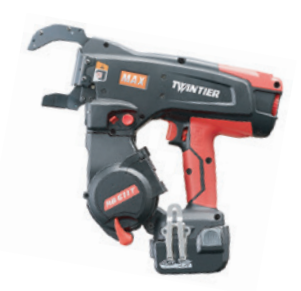
RB611T Ties #5 x #5 Up To #9 x #10 with 19Ga. Wire