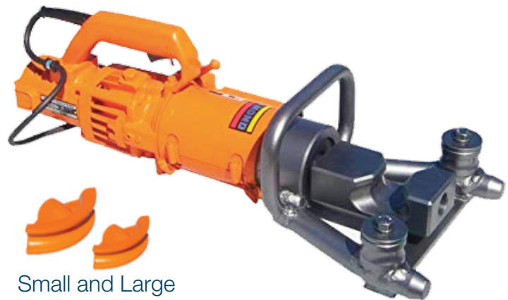
Small and Large Bending Die Set

It helps save valuable man-hours by cleanly and efficiently bending or straightening bent rebar. It functions as a simple 90° portable electric rebar bender. The interchangeable bending hook covers rebar diameters from #4 to #8 GR-60. Maximum pressure for bending and straightening ranges from 8.5 to 11-tons. It's portable and versatile enough to bend or straighten rebar in-place with its push/pull hydraulic capabilities. It will bend a 90° angle in only four seconds.