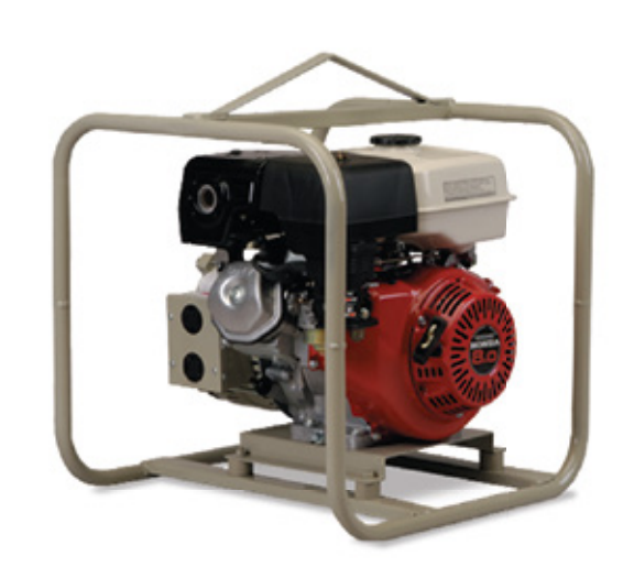
High-cycle And Select-cycle