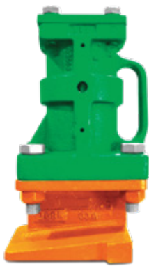
RAIL-SHAKER™ Hopper Car Pocket Vibrator