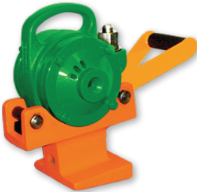
CAR-ROCKER™ Hopper Car Pocket Vibrator