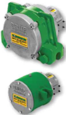
BRUTE® Hopper Car Vibrators