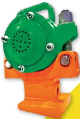
WHIRLWIND™ Hopper Car Pocket Vibrator