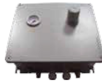
ATEX certified Ex II 3D T 275°F Ambient Temperature : 23°F / + 105°F