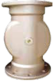
Cast aluminium alloy