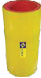
NR Natural Rubber anti-abrasion