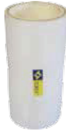
NBR Natural Rubber food-grade